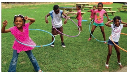
Bethany House children having some summer fun!

BHA serves over 50 children in its Preschool and After-school programs. This year the programming has expanded to include adolescent and young adults.