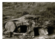
Buried in a Tomb