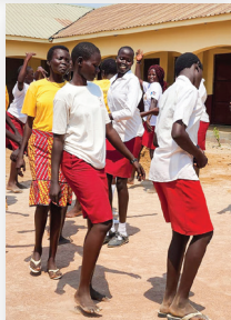
Abukloi Foundation is considered one of the top secondary schools in all of South Sudan.

Abukloi Foundation provides micro loans for small businesses that are started by some of the former students.